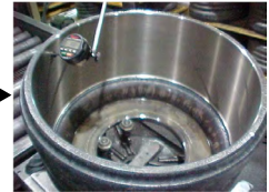
Machine braking surface & pilot