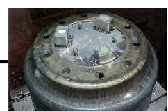
Drill bolt holes