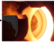
Pour molten cast iron into spinning shell