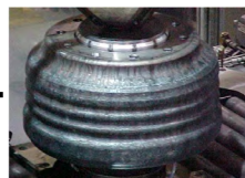
Machine to balance