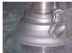
Cold form 1/4" thick steel blanks